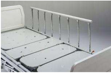
Side Rail Vertical for Electric Bed - $10/ week

1205 South Road St Marys SA 5042 Phone: (08) 8346 3733 Email: sales@ilcmc.com.au Website: www.ilcmc.com.au