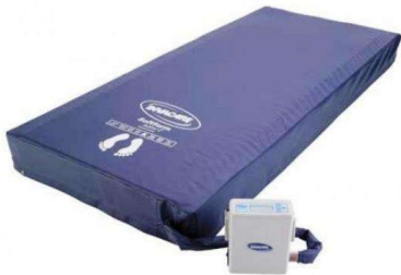
Variable Pressure Mattress with Pump - $55 / week