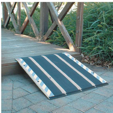
Ramp - $15 / week